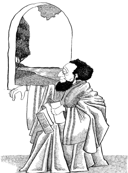
AUGUSTINE OF HIPPO