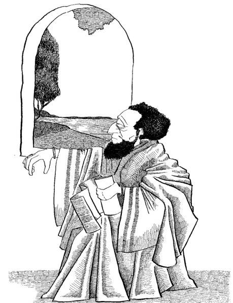
AUGUSTINE OF HIPPO