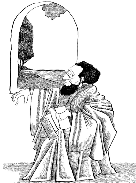
AUGUSTINE OF HIPPO