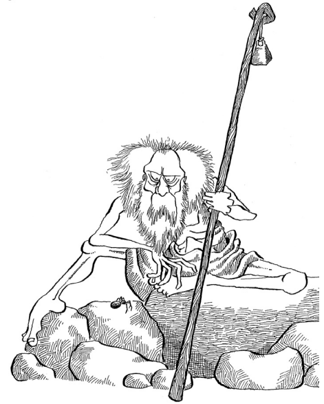
ANTHONY OF THE DESERT