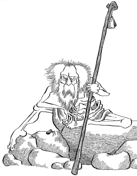
ANTHONY OF THE DESERT