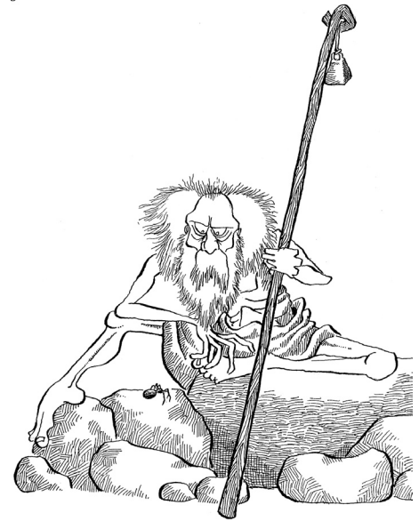
ANTHONY OF THE DESERT