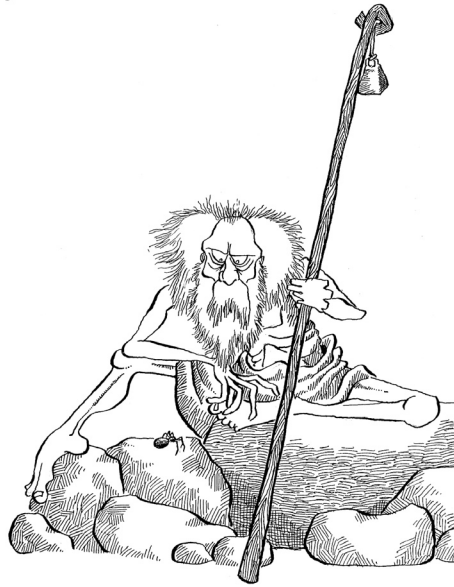
ANTHONY OF THE DESERT