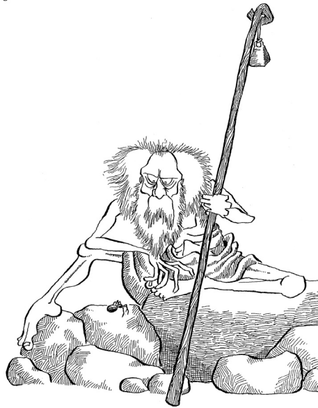
ANTHONY OF THE DESERT